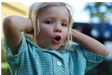
Being very noisy